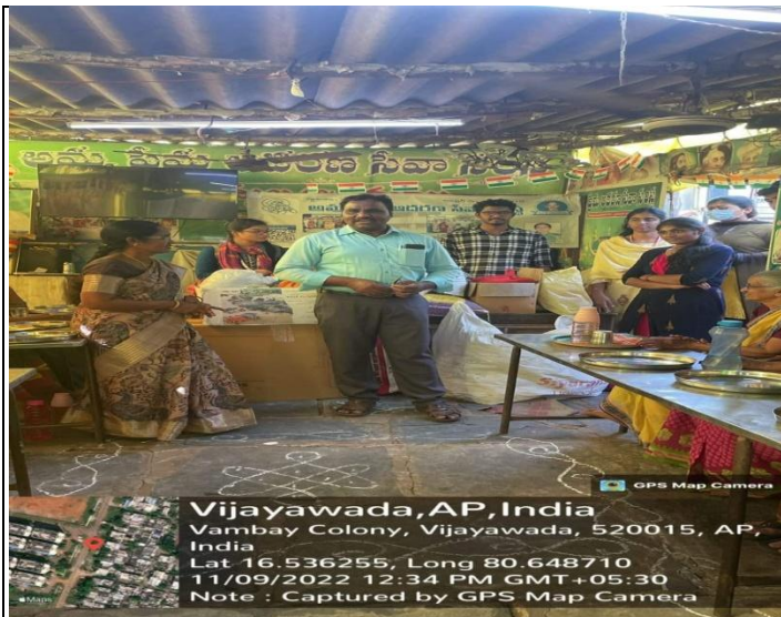
Vijayawada, AP, India Vambay Colony, Vijayawada, 520015, AP, India Lat 16.536255, Long 80.648710 11/09/2022 12:34 PM GMT+05:30