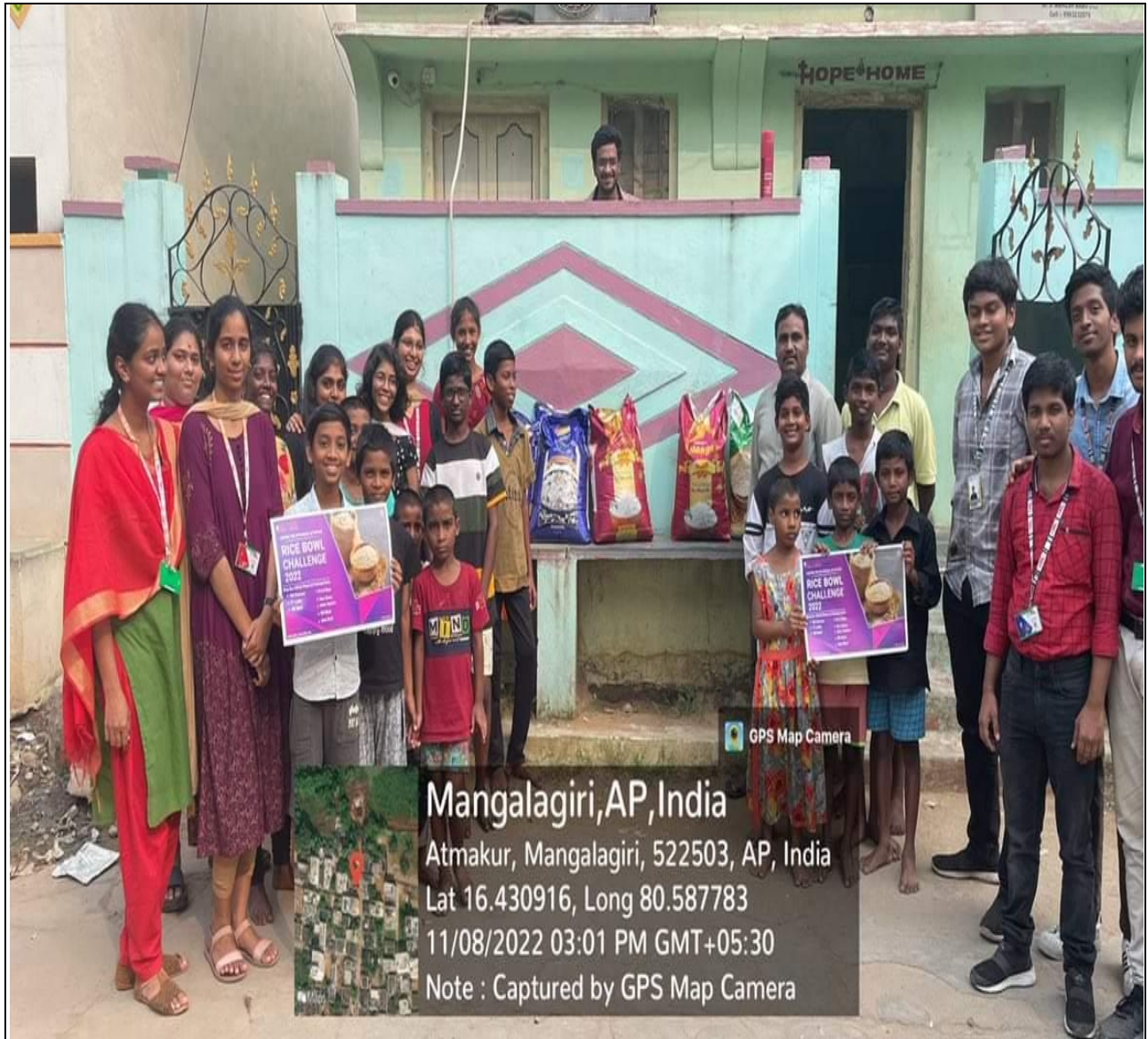
Mangalagiri, AP, India Atmakur, Mangalagiri, 522503, AP, India Lat 16.430916, Long 80.587783 11/08/2022 03:01 PM GMT+05:30 Note : Captured by GPS Map Camera